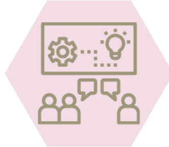
Exciting Programme and Workshops