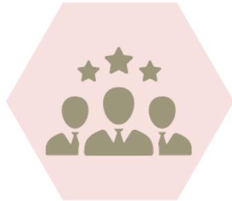
Local Experts & Renowned Speakers